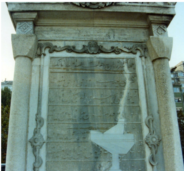
Fig. 2: Monument of Guru Nanak This monument is about 15 ft high and about 6 ft wide constructed in mortar. It is situated in a public park at the shore of the Straits of Bosphorus towards Istanbul, Turkey, where the West starts (Fig. 1). At the end of the first line of the inscription 'Nanak' in Arabic/Persian alphabet is clearly legible. Rest of the inscription starting from second line onward is not easily legible to be deciphered.

According to Fauja Singh and Kirpal Singh Guru Nanak boarded a boat which sailed from Sonmiani through Gulf of Eden and Red Sea to Jeddah (Al Aswad), a port near Mecca. They say that after visiting Mecca and Medina Guru Nanak traveled directly to Baghdad in Iraq then to Tehran and Kabul and finally back to (Talwandi) Kartarpur. They argued that Guru Nanak followed direct and shortest route to Baghdad than that of long route through