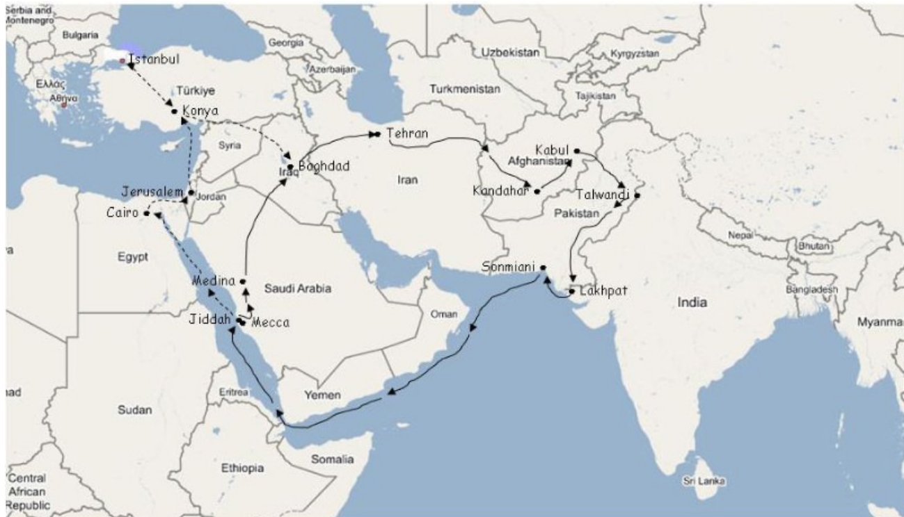
Fig. 4: Map of India and Middle East

Solid lines show the general accepted travel of Guru Nanak.