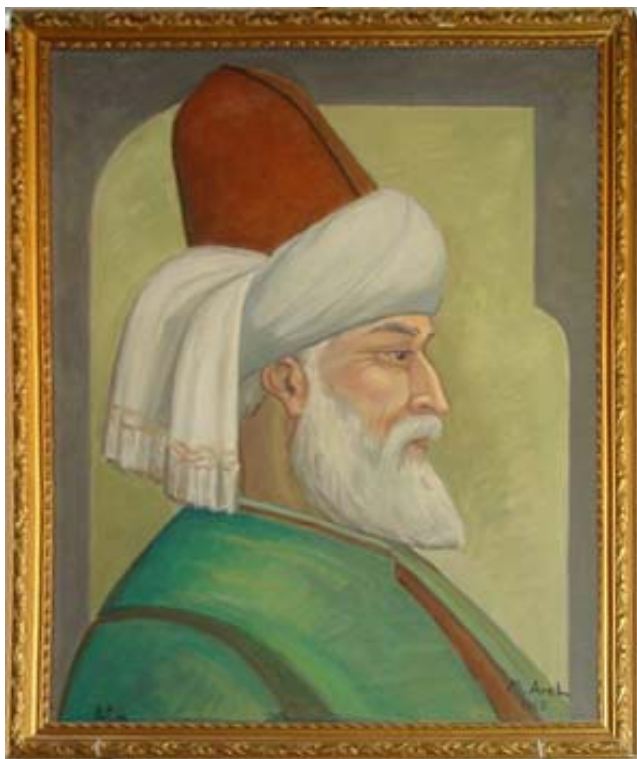
Fig. 11. Mevalana (Maulana) Jalaleuddin Rumi (1207-1273 CE). From the Museum of Hazrat Maulan Musum, Konya, Turkey.