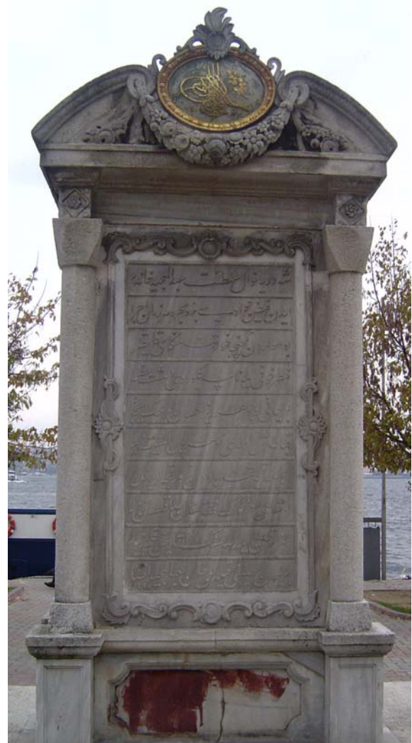
Fig. 9. Full view of the other side of the monument facing the city (called back side of monument). Inscription on this side is quite clear and legible.

still speaks Persian. His interpretation of inscription on the side facing city is as follows (Fig. 9): “When Abdul Majeed Khan became the king of the land of great river of Naval, it was the day of generosity and prosperity for all the seas and the deserts he made the flowers so strong that all the fears and jeopardy disappeared from this desert. By the jewel of his mercy, the river of peace started flowing. Year 1217 Hijri.” He said that it is 1428 Hijri now that means it is 211 years old writing. It means round about 1786 CE.