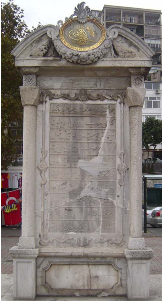
Fig. 8. Full view of the monument facing the Straits of Bosphorus (called front side of monument). The last word of the first line looks like ‘Nanak’ (left side).